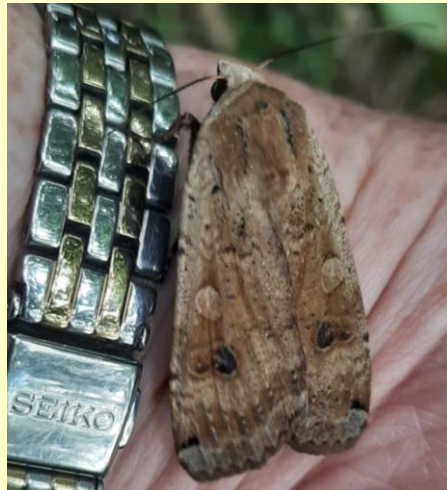
Kilpeddar farm , Forester moth, Yellow Underwing moth.