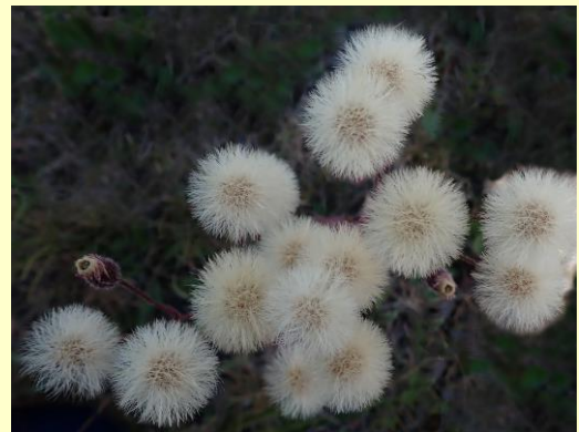
Mount Lucas Windfarm , Pulicaria dysenterica , Erigeron acer .

In June 2022 BLOOM returned to the Phoenix Park for the first time since 2019. DNFC participated in the event and members promoted the activities of the club and the Federation of Irish Field Clubs from our stand in the Conservation Zone. The public and visiting members were invited to view a display of publications, identification booklets, photographs and posters. Some printed materials, including an A5 page summary of the DNFC position paper ' The case against 'wildflower' seed mixtures ' were distributed.