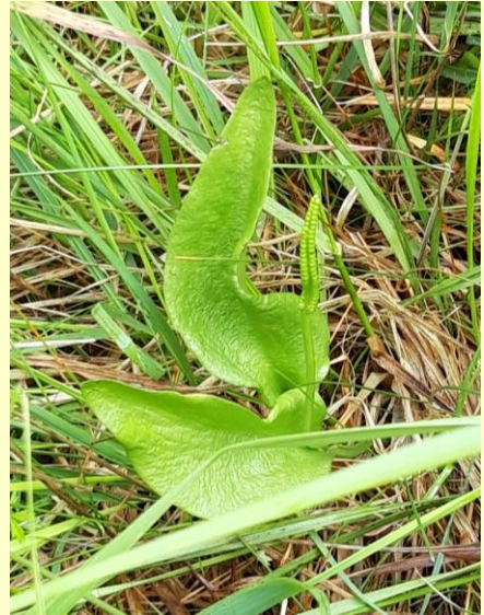
Corballis & Island Fen. Carlina vulgaris , Ballota nigra , Ophioglossum vulgatum .