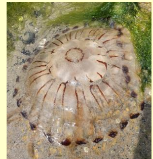
Seapoint, Snakelocks anemone, rock pools, Compass jellyfish.

Field meetings. In the past year our events secretary coordinated a full and varied programme of visits to a number of different habitats including, most recently, outings to Island Fen, Co. Offaly, traditional hay meadows and permanent pastures in Kilpeddar, shores and sand dunes north of Portrane, the rock pools at Seapoint, river plants of the Boyne, habitats on cutaway bog at Mount Lucas Windfarm and hedgerows in Ballymun. Outings were led by club members and visiting experts, we acknowledge the time given and the insights shared during field meetings.