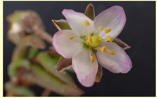
Portrane Shore , Glaux maritima , Limonium humile , Spargularia media .

Our WhatsApp Group has gone from strength to strength. It was a valuable communication and information exchange forum for much of 2020 and 2021.