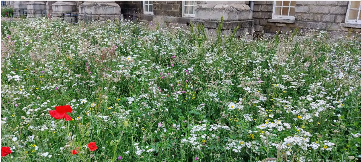
Fig. 3. Mass plantings of eye-catching, fast-growing, quick-flowering plants (Yarrow, Campion, Poppy, Oxeye Daisy, etc.) at Trinity College Dublin, June 2021. This grouping misrepresents the species assemblages that would occur in nature and does not meet the complex habitat requirements of threatened insects.