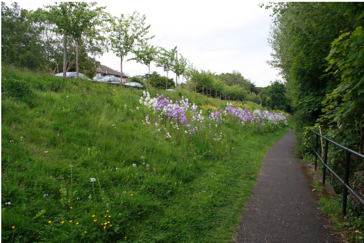
Fig. 1. The grassy area in the foreground contains Cuckooflower, Cardamine pratensis , a native species of damp grassland in Dublin and a major food plant of Orange Tip butterfly larvae. The conspicuous purple and white flowers further along the bank are the related, non-native Dame's-violet, Hesperis matronalis , apparently recently sown and displacing Cuckooflower. Growing amongst the Dame's-violet are the non-natives Honesty, Lunaria annua , Flax, Linum usitatissimum , and Californian Poppy, Eschscholtzia californica . St Mobhi Drive, June 2021.