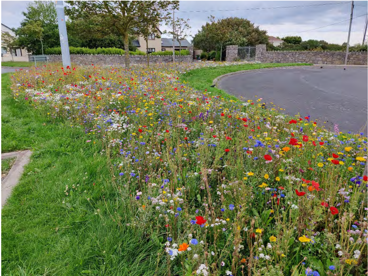
Fig. 2. A pastiche of predominantly non-native annual species — an impossible assemblage in nature — growing along roadsides in Portrane, Co. Dublin (July 2020). This mixture was inserted into the traditional territory of Prickly Poppy, Papaver argemone , a rare species of sandy fallow ground near the sea, now in serious decline due to suburban encroachment.