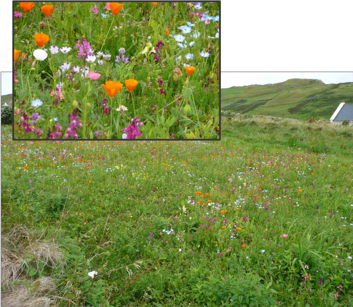
Fig. 5. Clare Island (above) was selected by the Royal Irish Academy as the site for a seminal study of flora and fauna, on account of its almost uncontaminated condition, in the early 1900s, and a series of studies was conducted by distinguished national and international experts, led by Robert Lloyd Praeger. Sowings of exotic species (above, photographed in 2010) have not enhanced its natural attributes.